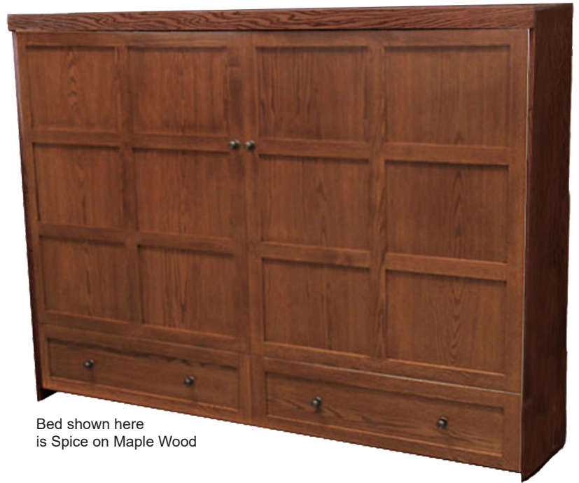
Bed shown here is Spice on Maple Wood

Requires standard, innerspring mattress up to 12" thick (not included.)