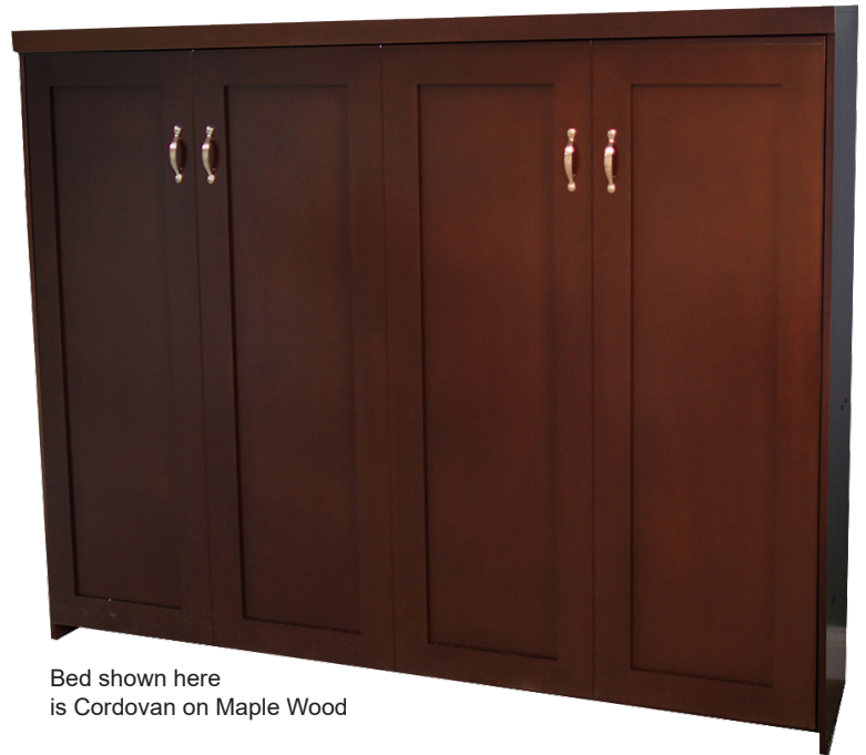
Bed shown here is Cordovan on Maple Wood

Requires standard, innerspring mattress up to 12" thick (not included.)