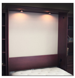
Side Cabinets Lighting (Refer to side cabinet sheet for more information.)