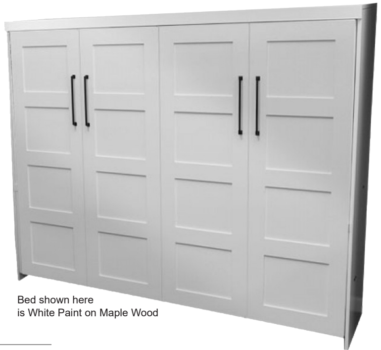
Bed shown here is White Paint on Maple Wood

Requires standard, innerspring mattress up to 12" thick (not included.)